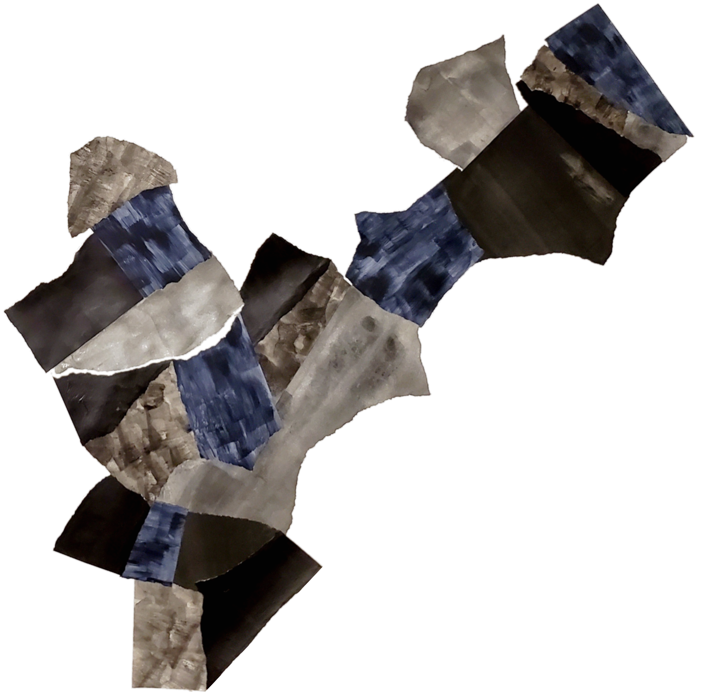
Softness Makes You a Target (Colony Collapse Disorder series), 2022, Watercolor collage on paper, 24 in x 18 in.