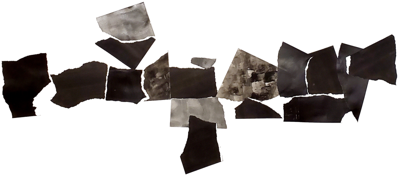
“Survival Apparatus” (Colony Collapse Disorder series), 2022, Watercolor collage on paper, 24 in x 18 in.