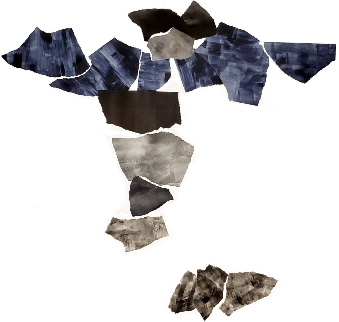
The Summer the Susquehanna Swallowed Two Boys, Eight (Colony Collapse Disorder series), 2022, Watercolor collage on paper, 24 in x 18 in.